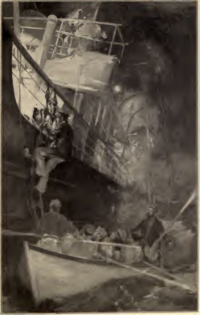
"He was coming down the ladder slowly."